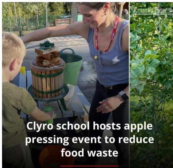
Clyro school hosts apple pressing event to reduce food waste

From collecting apples to enjoying the juice, the children had a fantastic time and the sun even came out. A big thanks to Wobbly Owl and the Friends of Clyro for organising the event.